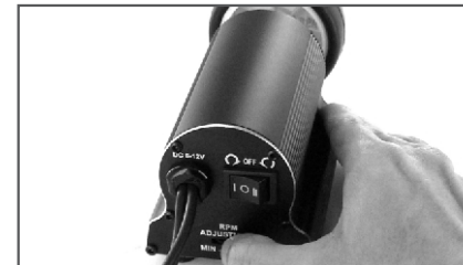
5. Adjust RPM knob if necessary