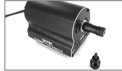
1. Remove thumb screw