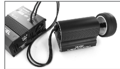
3. Connect tire sander to power supply or 2S LiPo battery