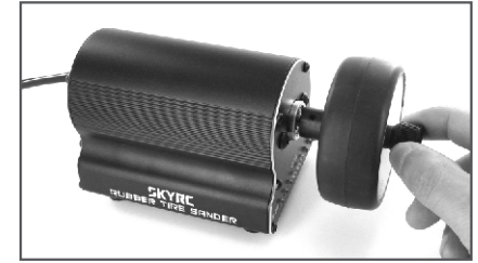
2. Put rubber tire to tire sander and tighten the thumb screw firmly